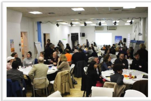
Frederick Arts Council Town Hall at New Spire Arts Studios reviewing Public Arts Master Plan with over 100 attendees