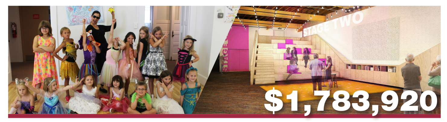
SUPPORTING MAJOR PROJECTS including New Spire Arts, Square Corner, Public Art, and City Street Maintenance.

that prevent, alleviate, or help people cope with crisis through crime prevention, legal services, employment, food, housing, shelter and healthcare such as mental health treatment, crisis intervention, dental, and medical care.